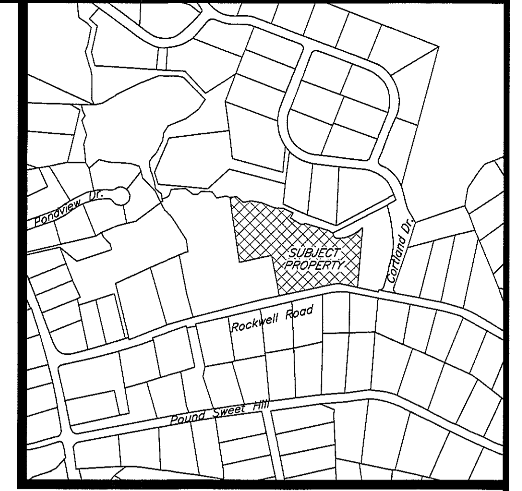
Vicinity Map 1"=600'

Important Note: Additional underground utilities may exist Prior to any excavation or construction, contact: "CALL BEFORE YOU DIG" 1-800-922-4455 or 811