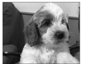
8 week old pups, 1st shots, health clearance and micro chip. DOB 6/16/2023 860-997-3701